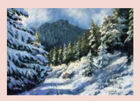
Winter Rhythem and Blues