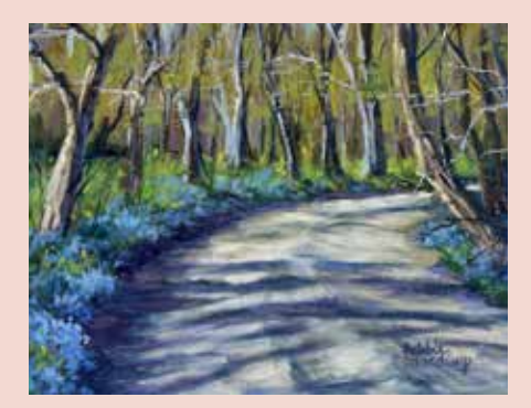
Country Road Blues