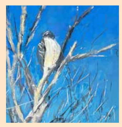
Surprise along the Hike