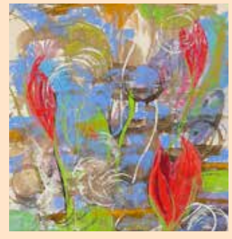
From Diana Sanford workshop