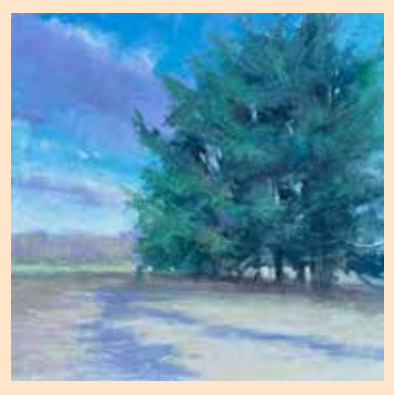
Peaceful Easy Feeling