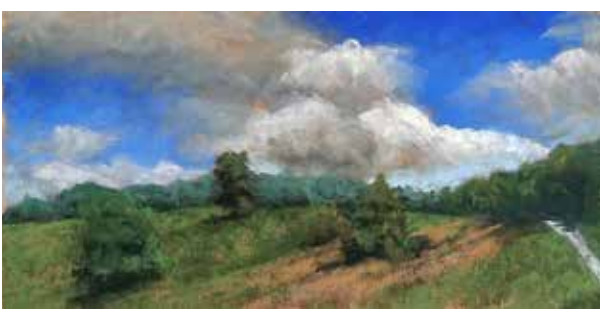
View from the Parkway

Joan participated in the Plein Air Unleashed 5-day